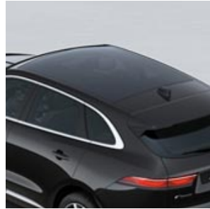
ROOF OP- TION